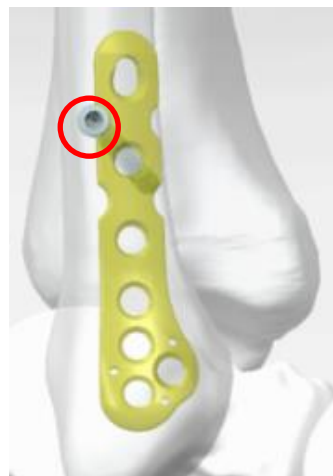
▲Guide Groove for Syndesmotic Screw